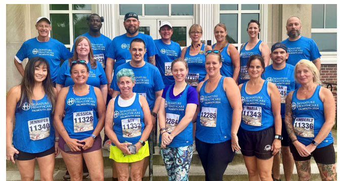
2024 Team "Bringing Boston to Brockton."

The race was held on Sunday, August 12, 2024. Twenty-six runners were part of the "Bringing Boston to Brockton" charity team to support patient care at the John, Steven and Caryl Greene Cancer Center. $36,000 was raised. Thank you to all our runners and those who supported them!