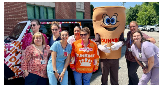
Dunkin's Icy Joe made an appearance at Signature Medical Group 110 Liberty Street to appreciate staff.